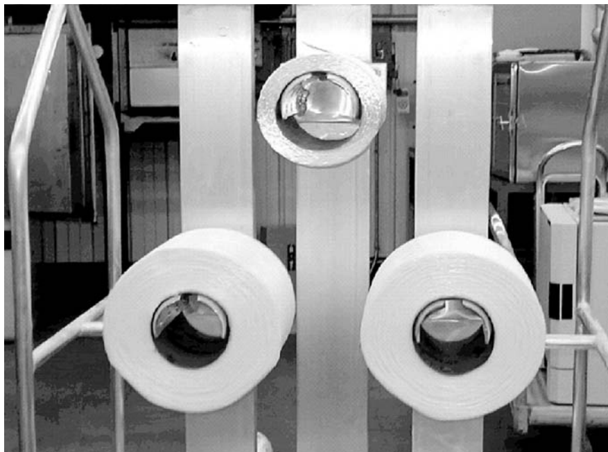
Product is available in both 36 kg package or 7 kg package

AGY has introduced VeTron™, a new high performance glass roving that answers the composites industry's need for a vinyl ester compatible reinforcement with higher performance than regular E-glass and lower costs than aramid and carbon fibers. VeTron provides superior modulus and strength for the most demanding applications. VeTron allows 15% more rigidity and 35% more strength than E-glass at a lower price than S-2 Glass® fiber. In addition to greater mechanical performance, VeTron features a lower density of less than 2.5 g/cm 3 , superior acid resistance to E-CR or Advantex® glass fiber with good electrical properties.