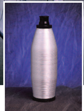
S-2 Glass Fiber Yarn